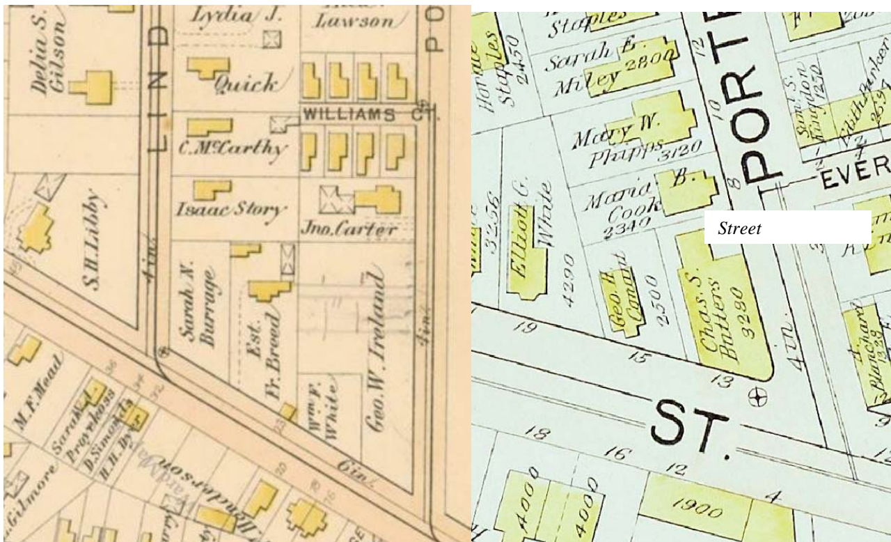
1884 Hopkins Plate 13

The buildings lack integrity. The house does not retain its form and massing. The storefront has lost its façade to modern materials and design.